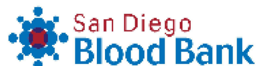
Photo ID required. Arrive hydrated.

All donors will receive a Limited 'Future' Edition SDBB 70th Anniversary t-shirt. (sizes subject to availability and while supplies last)