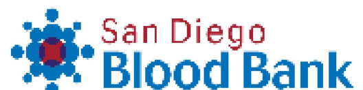
Photo ID required. Arrive hydrated.

All donors will receive a Limited 'Future' Edition SDBB 70th Anniversary t-shirt. (sizes subject to availability and while supplies last)